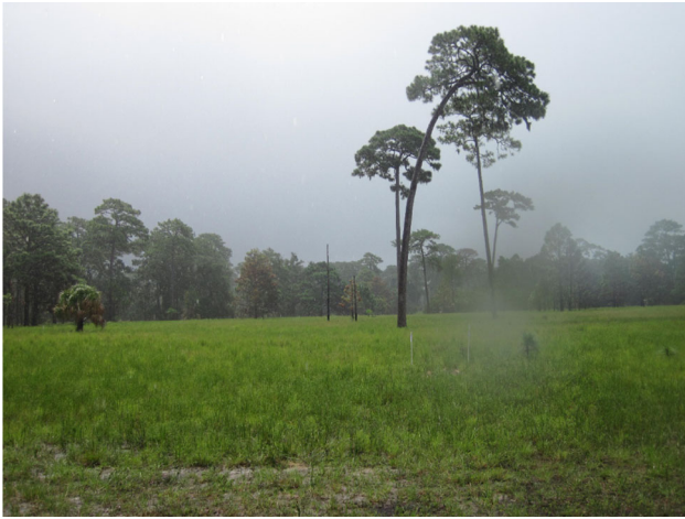
Figure 1. Gopher tortoise habitat at St. Catherines Island in southeast Georgia, USA, 2006–2013. Periodic mowing is used to maintain the open landscape, which is a former cattle pasture with sparse mature pines, no shrub midstory, and a grassy understory that retains some native herbaceous species. Note white stakes in the right foreground marking the patch of sand associated with the burrow of an immature gopher tortoise naturally recruited into the translocated population.

nine-banded armadillos ( Dasypus novemcinctus ) have since become established on the island (T. M. Norton, St. Catherines Island Foundation, personal observation).